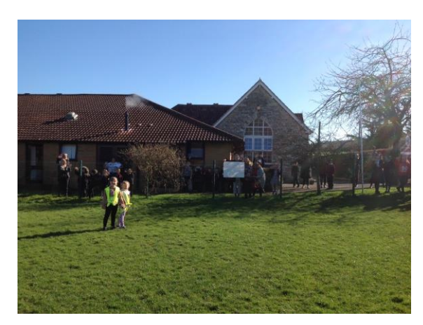
DID YOU KNOW?

Well Done Niamh and Aeryn for completing your Lockdown Challenge, running a mile a day. They have completed 32 miles and raised over £300 for charity. Brilliant ©!