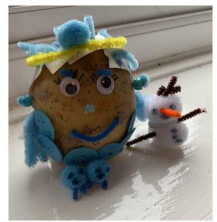
Fantastic results creating book characters from a potato: very creative!