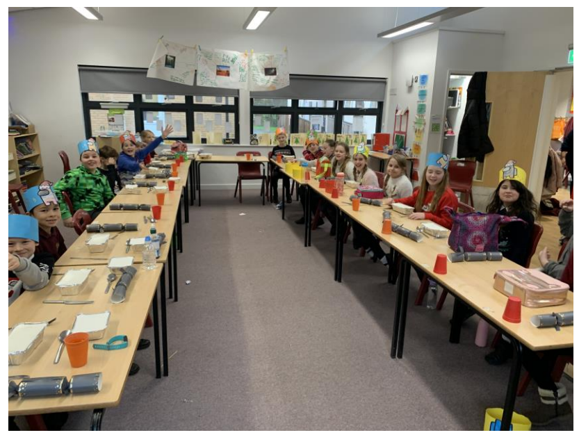
Finally, have a great Christmas. Please adhere to all government guidelines so that on our return we are as safe as we can be.